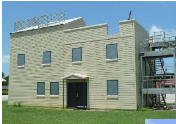
Fire Tower Prop

Project Start: 6/2018 Est. Completion: 1/2019