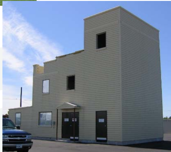
Rappelling Tower Prop

Project Start: 6/2018 Est. Completion: 1/2019